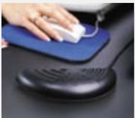
Optional Wireless Communication