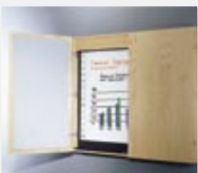
Optional Enclosures and Mobile Stands

PolyVision's TS Series of Interactive Whiteboards is ideal for power users who prefer to learn product-specific software.