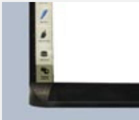
Interactive Projection on a Touch-sensitive Surface